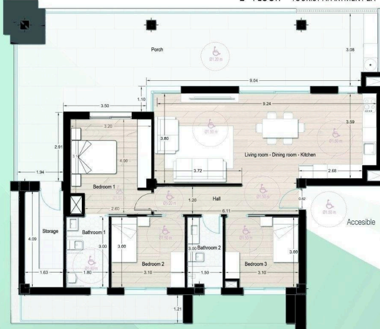
BLOCK A 2 nd FLOOR TOURIST APARTMENT 2A