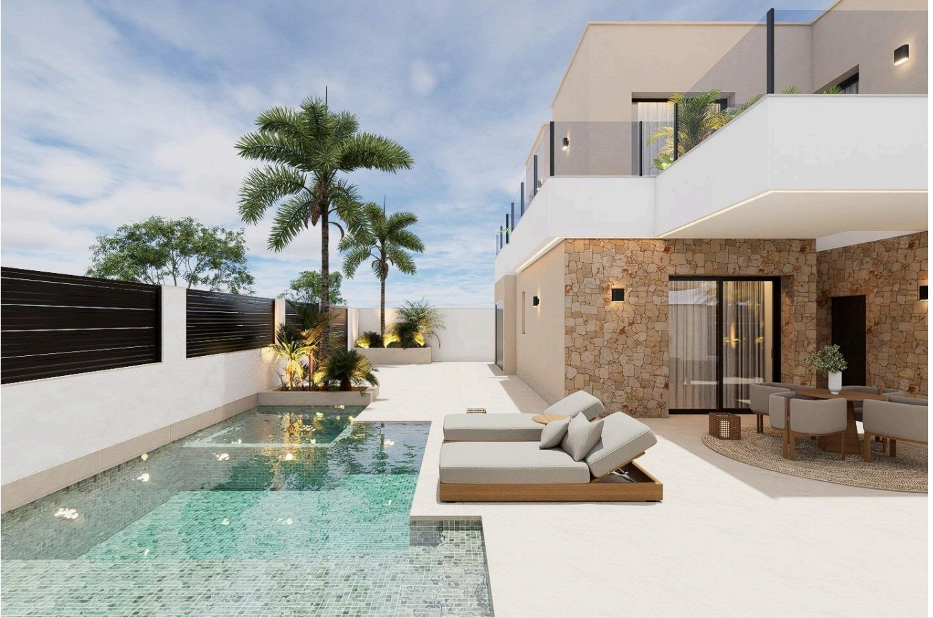
VILLA CON PISCINA EN SAN PEDRO DEL PINATAR OPCIÓN A.1.1. PLANTA BAJA.