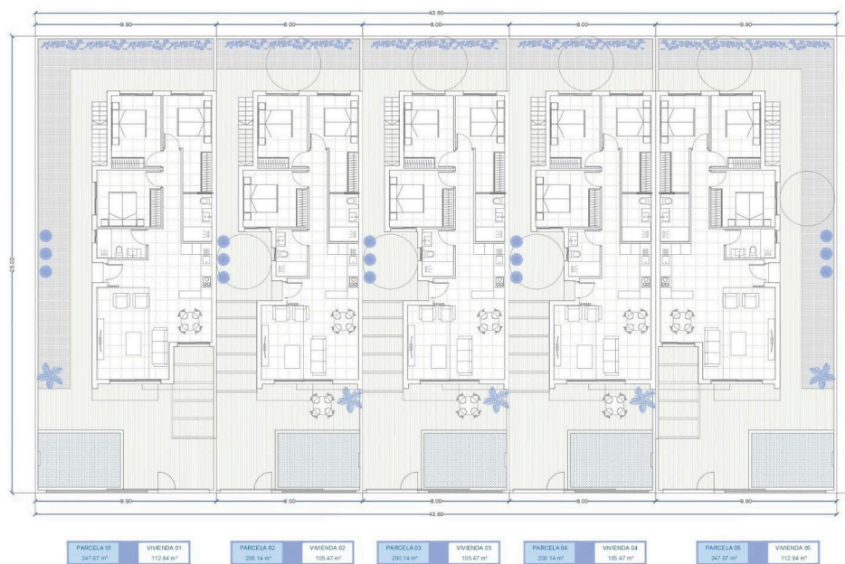
5 VIVIENDAS UNIFAMILIARES Y PISCINAS