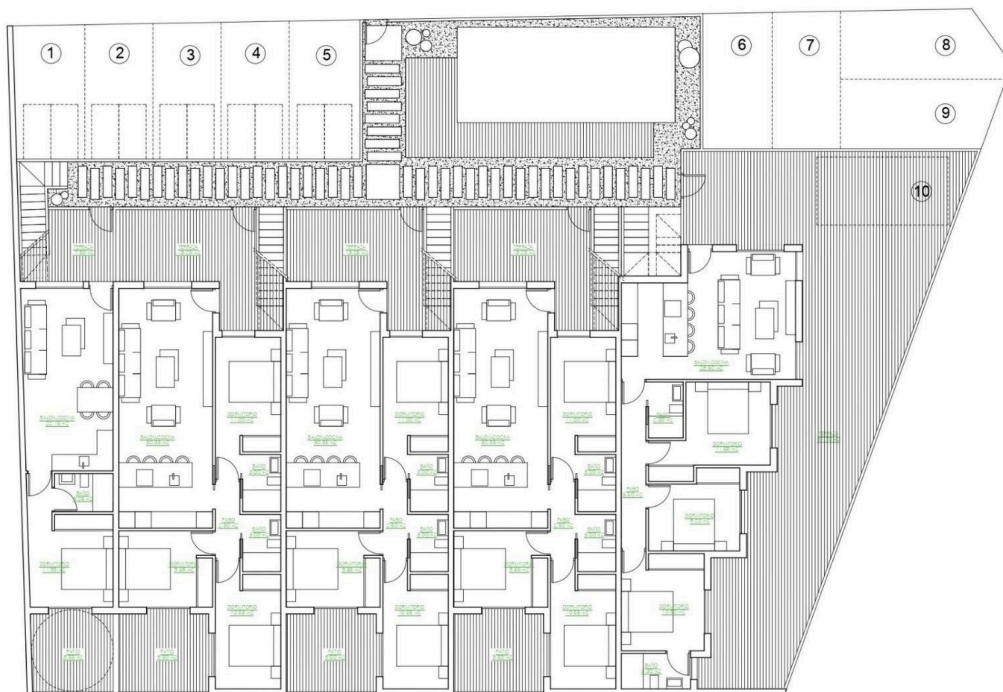
Planta Baja Conjunto